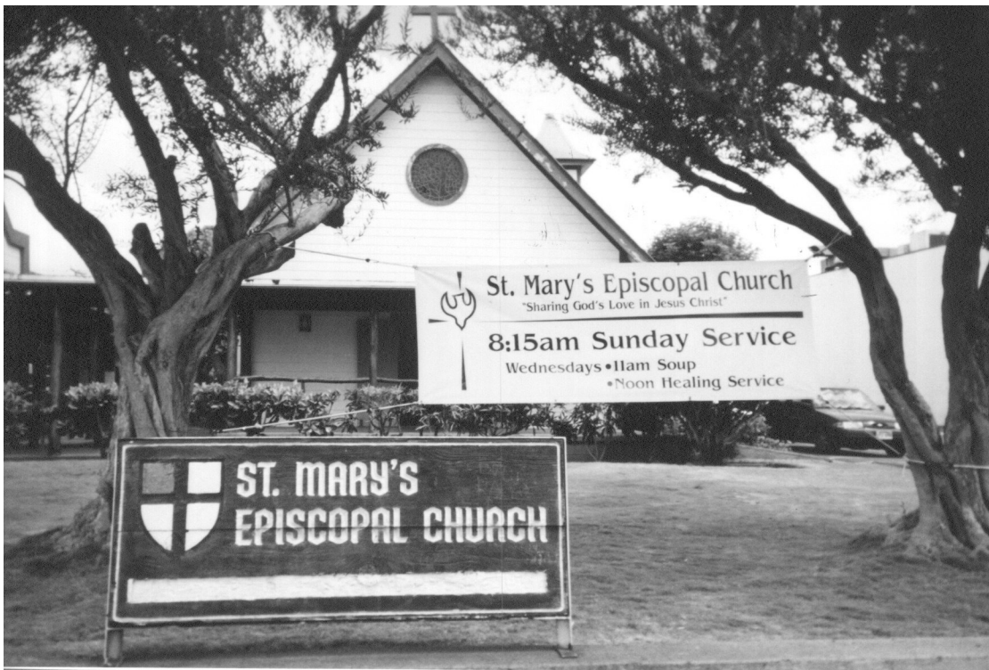
St. Mary's Church, 2002