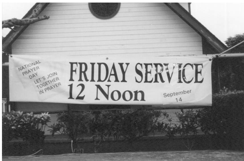
September 14, 2001