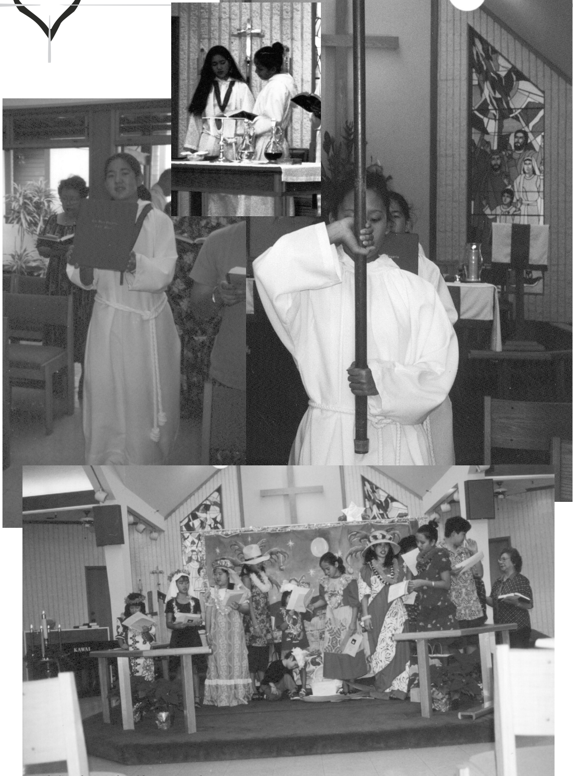
Youth Sunday and a Christmas Play