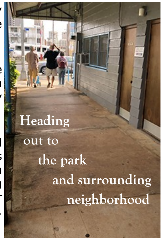
Heading out to the park and surrounding neighborhood

The Sandwich Ministry is continuing to expand and help is always needed to make sandwiches as well as distribute to those in need. If you would like to help with this continuing endeavor either through monetary support or volunteering your time, please contact St. Mary's for more information.