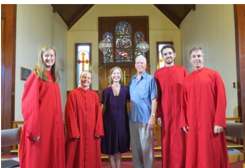
Sacred Choir Singers with Speaker and his wife