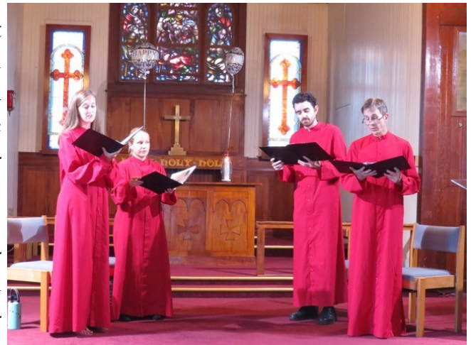
Hawaii Sacred Choir: