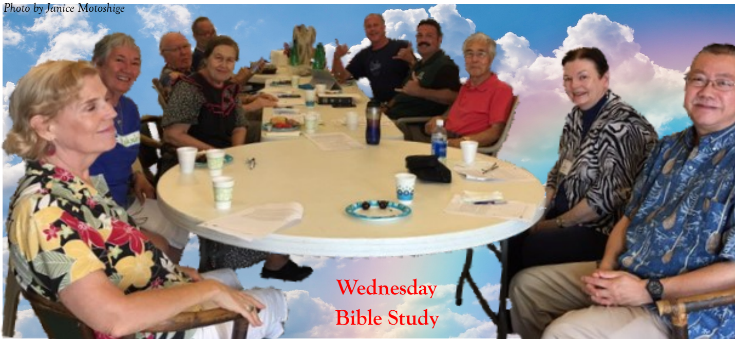
Wednesday Bible Study