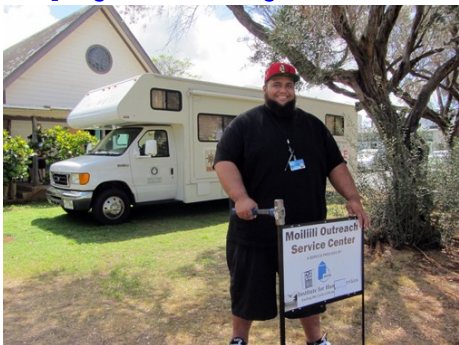
Project Director IHS