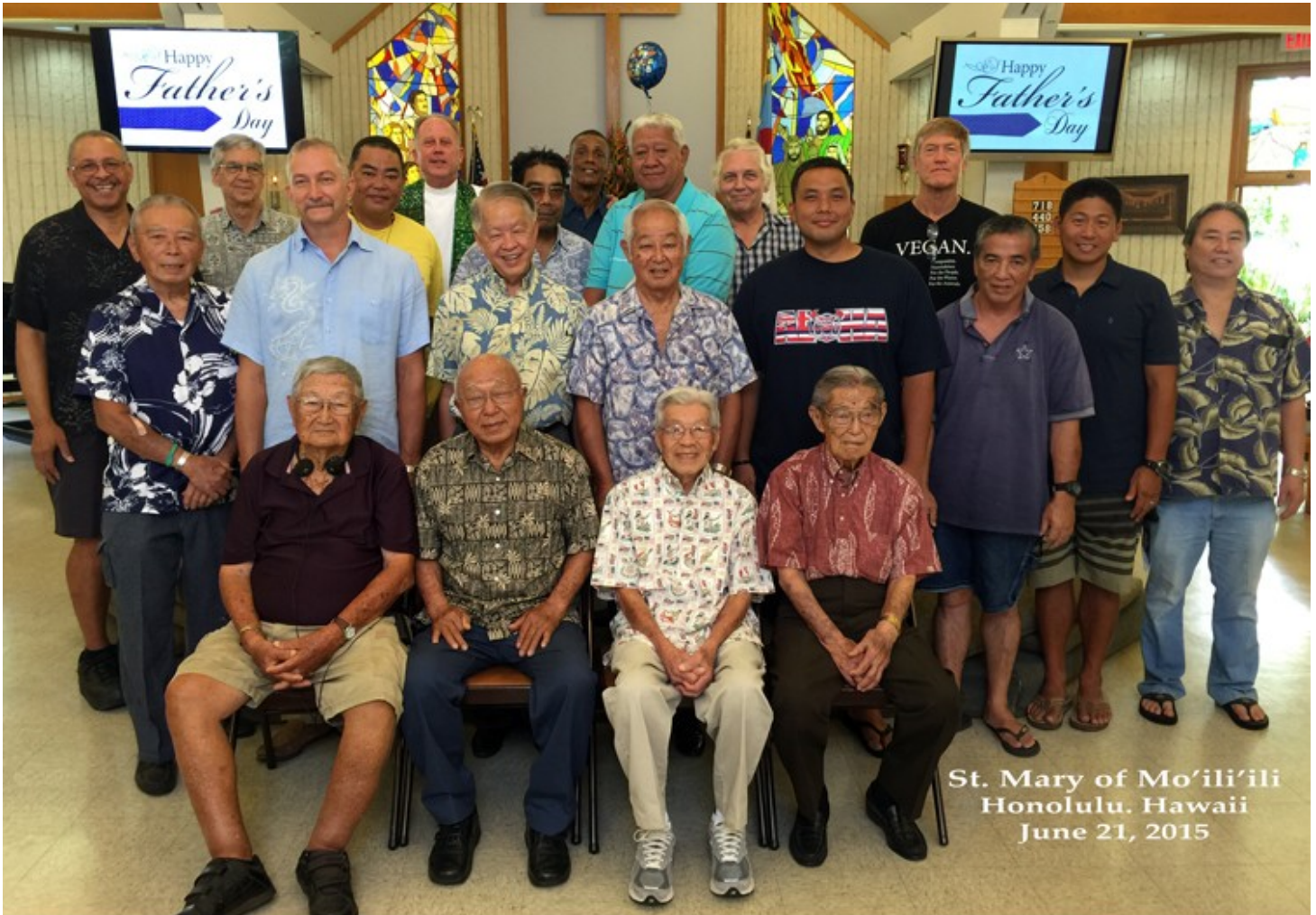
St. Mary of Mo'ili'ili Honolulu, Hawaii June 21, 2015