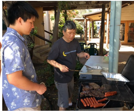
Cooking some great steaks: