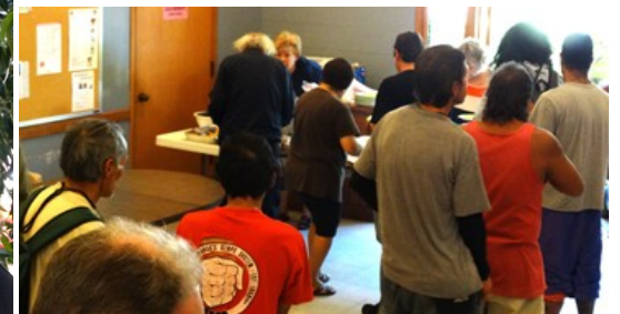
Serving Homeless meal to sit down and eat