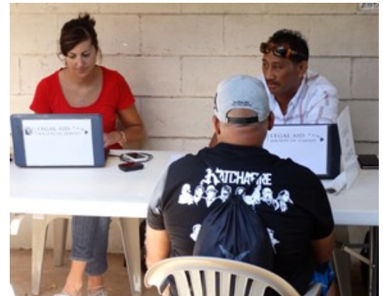
Providing Legal Aid Services

Next opportunity for church volunteering: May 28th, 9am.