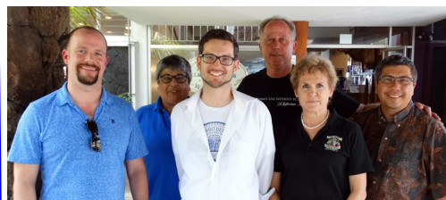
East Honolulu Clergy Meeting - April 23