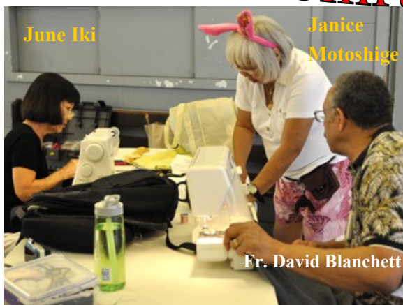
Sewing t-shirts, turning them to bags