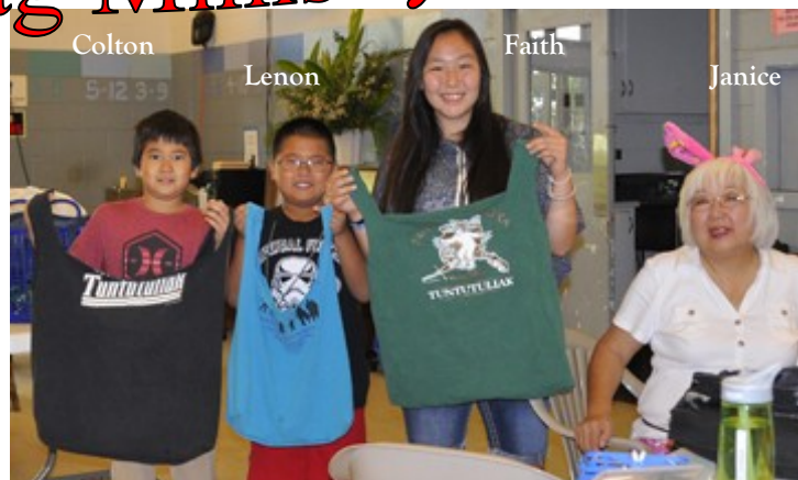
Youth holding up freshly sewed t-shirt bags