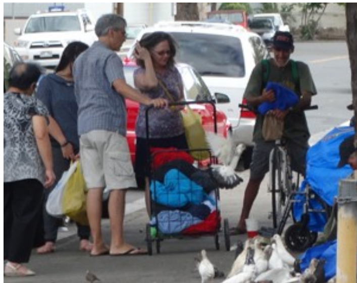
Handing out bags to grateful homeless