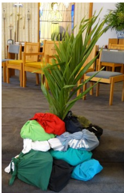
15 of completed 40 bags

Through a collaborate effort of three churches - Good Samaritan, St. Luke's and St. Mary of Mo'ili'ili - 40 t-shirt bags were able to be filled completely with: Energy Bars, Trail Mix, Vienna Sausage, Band-Aid Kits, Pre-moistened Wipes, Hand Sanitizers, Pocket Kleenex, Body Wash, Mouthwash, Lotion, Toothpaste, Cookies, Shampoo, and Combs.