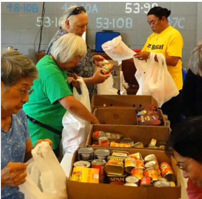
Photo left and below: are church volunteer who came one hour early (9:00am) to pack food bags and set up. Members are from St. Mary of Mo'ili'ili, St. Luke's Episcopal and Good Samaritan Episcopal Church