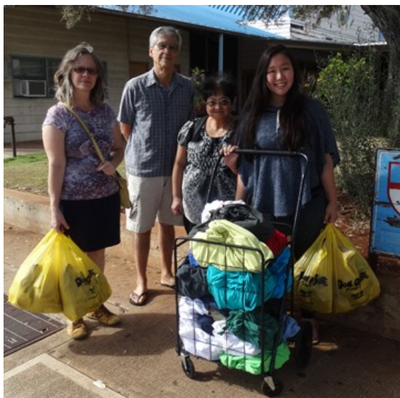
On the way to the local park to hand out bags