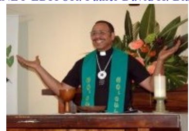
Associate Priest, St. Mary of Mo'ili'ili