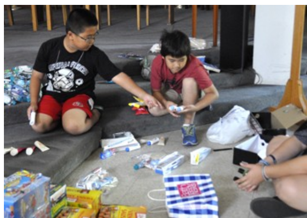
Youth from Good Samaritan and St. Mary counting bag