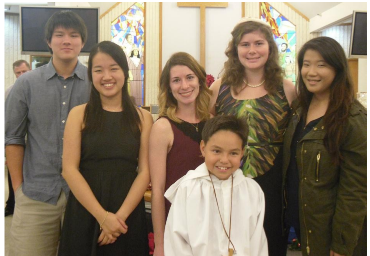
Christmas Eve Reunion