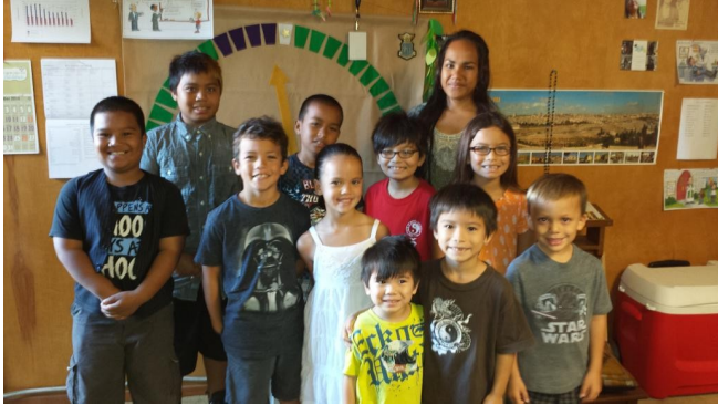
Sunday School Class

Photo taken of ten of the twelve youth in this class just before they played Bible bingo. The Church is looking for more adult help so there can be Sunday School for youth younger than six years of age.