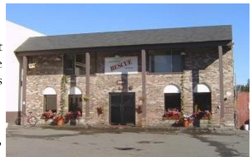
Anchorage Rescue Mission

At the writing of this article, it is minus one degree Fahrenheit in Anchorage, Alaska. I know the Hats are truly appreciated.