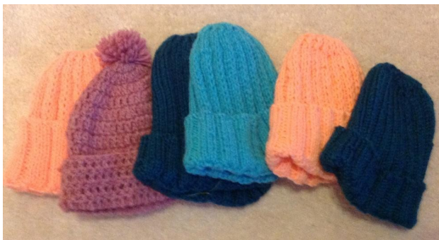
Knitted hats by Lucy Sewing Circle * Hononlulu, Hawaii