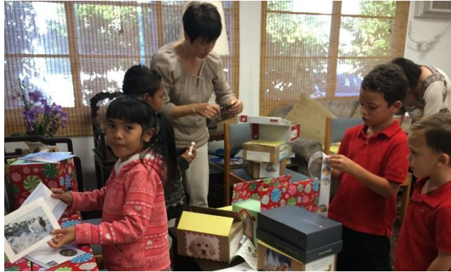
Prep and sort