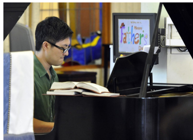
Guest Piano Player during Worship