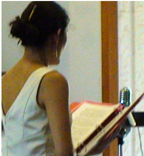
Hawaii Sacred Choir Soloist