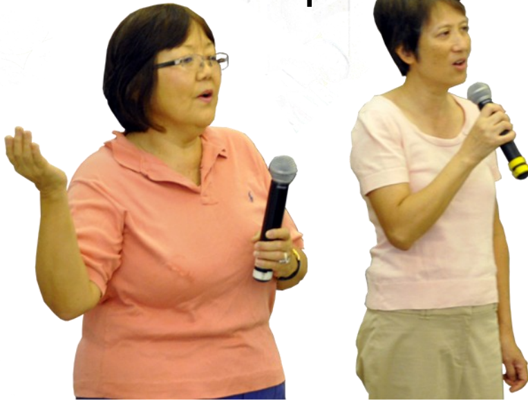
Giving God the Glory