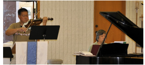
Always good music at St Mary of Mo'ili'ili